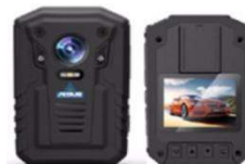
Body Worn Camera